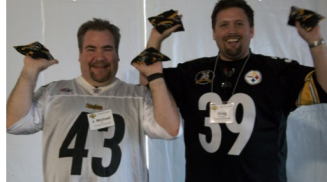
Colussy Chevrolet, Gold Sponsor